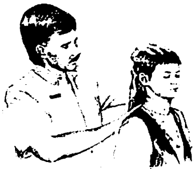
Awaiting a still point in the CSR.

In another case, a client recalled such hidden memories while being treated for back and neck injuries. She was lying face down on a table while we worked on an area of pain in the upper back. As I moved her scapula to reach a tender point, her arm began to move spontaneously with her index finger outstretched, giving the distinct impression of a little child being led away.