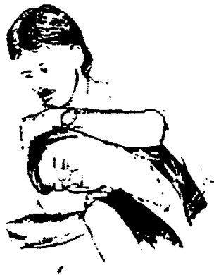
Following intrinsic bodily motion as a still point softens, motion resumes and soft tissue restrictions begin to release.

I took her finger into my hand and gently pulled her hand and arm upward. The reaction was instantaneous and authentic. She took in a deep shuddering breath, and with her awareness split in time, said in a whisper, "They're taking me... to ...". She paused for what seemed a long time. I waited, then asked, "Where are they taking you?"