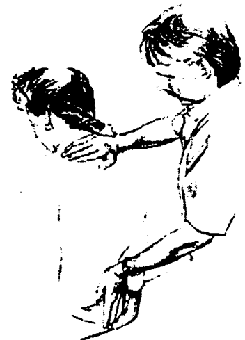
Assessing the CSR in the dural tube – sacrum to occiput.

I am not saying that movement therapy cures arthritis - far from it. What I am saying is that holding a mirror up for my patient to see her life as one of possibilities rather than restrictions gave her the courage to let go of her anger, take control of what was hers to control, and to get on with life. When I last saw her, grip strength and the ability to open and close her hands had improved over 70%. She was back playing tennis with an adapted racquet handle (something she wouldn't have considered prior to our sessions), and was starting to take golf lessons from a local pro.