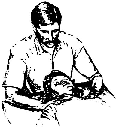
Assessing the CSR at the shoulders.