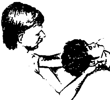
Hand position for assessing the CSR at the occiput.

of images - some known, some forgotten - he recalled being hauled out of bed by his drunken father late at night and forced to fight grown men, bare fisted, in a bar not far from his home; shooting a fifty caliber machine gun from the door of a helicopter into hooches and bunkers as Viet Cong twisted in agony in his sights; receiving minor wounds in battle; having his ankle almost torn off by the turret of a tank on which he was riding. He remembered hurting so badly from being beaten by his father that he would leave his body, float up into the corner of the bedroom and look down as his father bear a body that no longer felt the blows, laughing that his father could not get him to cry, and thinking himself crazy for being able to escape the pain in this way. Yet now - the pain was so great that even his tremendous will could not conquer.