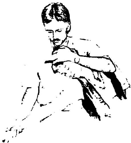
Second still point.

In this most critical area, where healing can come to the damaged vessels of the soul, nothing but total integrity, respect and safety will suffice on the part of the therapist. This is no stage for the display of ego or a refuge for those with a saviour complex. Therapists must use these techniques with understanding and thorough respect, holding the client's best interest as paramount for recovery.