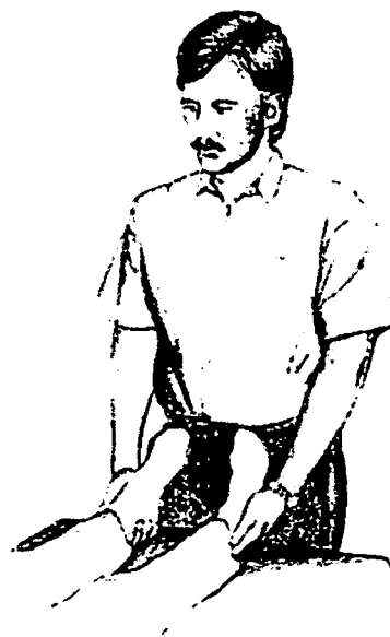
Assessing the CSR at the ankles.

Raised by his grandmother, a full blooded Sioux Indian, he had been taught Native American mind control techniques for dealing with pain. Used to fighting in self defense and surrounded by violence from boyhood, pain was nearly meaningless to him until the time of his accident.