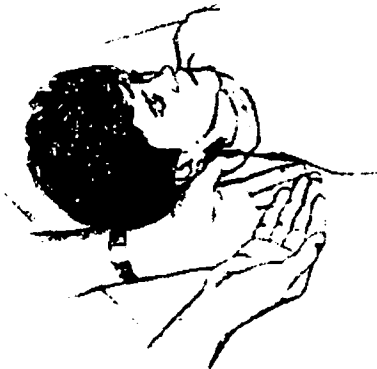
Assessing the CSR at the occiput.

He told me he was remembering his childhood, and that it had been a really tough way to live. In a dream-like montage